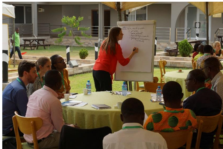
Figure 5: Working group session

The program continued with breakout sessions where the forum participants worked in groups to discuss topics on organizing linkages between the R4D and P4D components, how to disseminate ISFM technologies, and alignment with national policy frameworks. The working groups returned and presented their ideas.