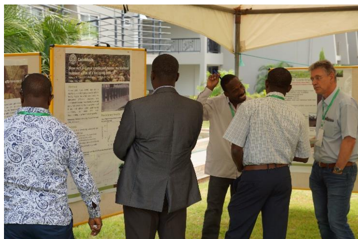
Figure 3: Poster exhibition

During lunchtime, a poster exhibition that presented the different research topics was organized. PhD students had the possibility to present and show their research studies, while the participants of the forum had the opportunity to gain more in-depth information on their research or ask questions on specific parts of the program.