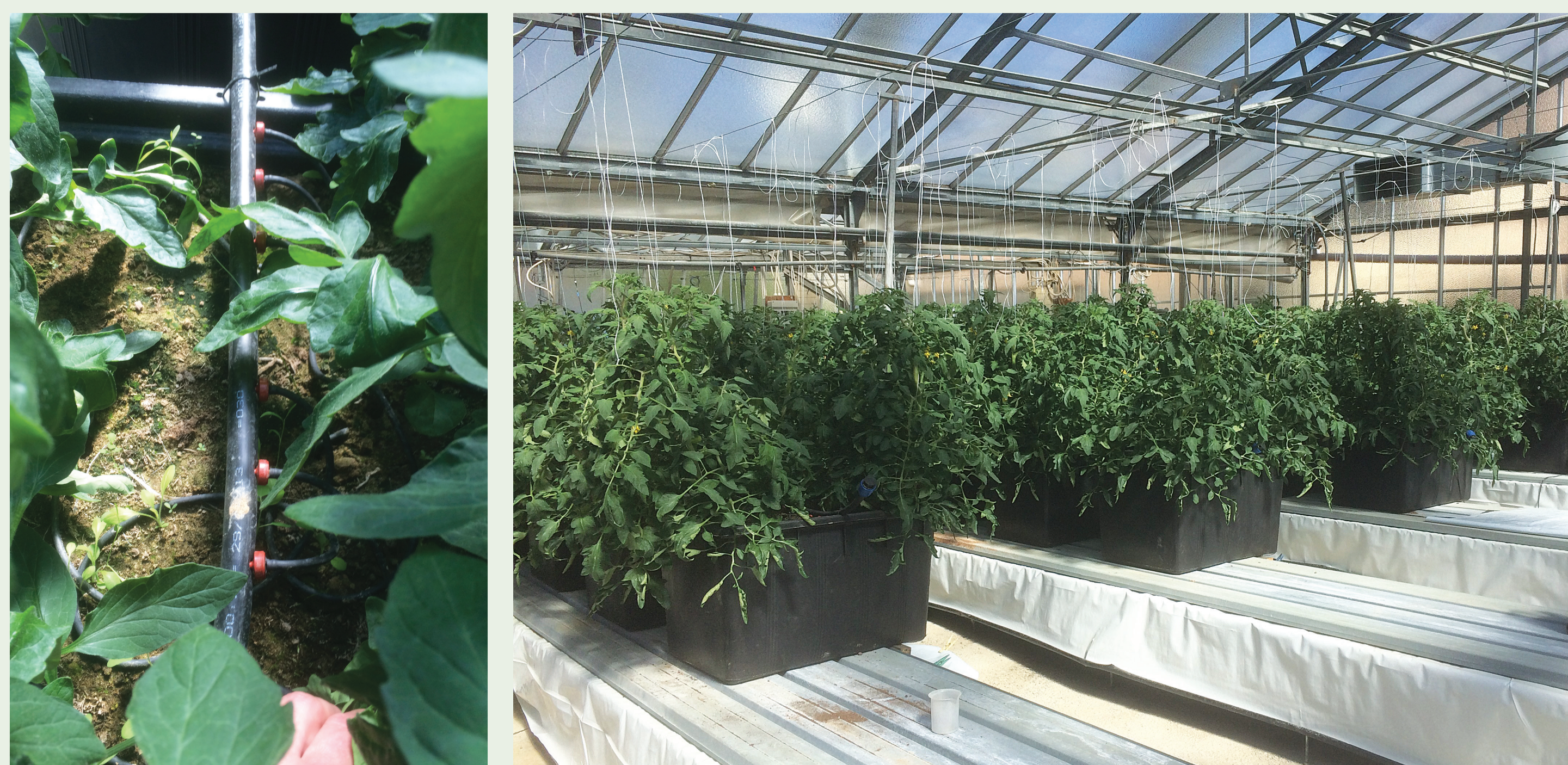
General view of the experiment

1 ICL Specialty Fertilizers, Netherlands; 2 Department of Agriculture, Food and Environment, Pisa University, Italy